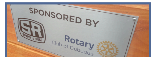
Donation of a wonderful raised garden bed from the Rotary Club of Dubuque. We planted a dozen pepper plants.