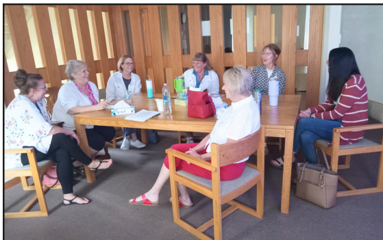
Gathering together for great spiritual teachings.