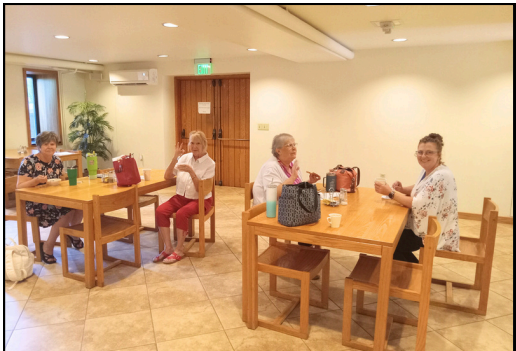
Enjoying a delicious breakfast & lunch.