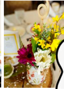
Decorations compliments of Lynn Ford