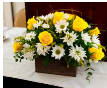
Roses, compliments of the Lansings