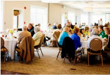
Beautiful gathering space