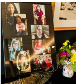
Photos of Staff and Past Residents